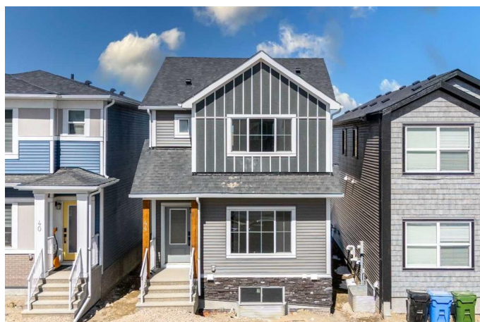
44 Lewiston Dr NE, Calgary, AB

Welcome to Your Dream Home- Presenting an exceptional opportunity to own a brand new, two-story home in the sought-after community of Lewisburg. Designed for modern living, this stunning residence seamlessly blends elegance, functionality, and comfort. Upon entering, youâ€™ll be greeted by an abundance of natural light and an open-concept layout that effortlessly connects the inviting family room, illuminated living room, and stylish kitchen. Luxury vinyl plank flooring flows throughout the main level, offering both durability and timeless appeal. This home surpasses standard builder specifications with premium upgrades, including sleek cabinetry, elegant interior doors, designer light fixtures, and sophisticated quartz countertops in the kitchen and bathrooms. Every detail has been carefully curated for refined living. Upstairs, discover three generously sized bedrooms, each offering comfort and charm. The primary suite is a true retreat, featuring a spacious layout, a double vanity, and a separate shower. The unfinished basement presents a versatile space with a separate exterior entrance and a bathroom rough-in- ideal for future development as a legal suite. Your vision can easily come to life. Step outside to the backyard with a large deck, perfect for entertaining or relaxing. Located near the parks, pathways, and recreational facilities, with access to schools, child care, and future educational developments. Schedule Your