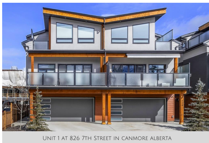
UNIT 1 AT 826 7TH STREET IN CANMORE ALBERTA

With four spacious bedrooms and four luxurious bathrooms, this home is designed for comfort and convenience. Three of the bedrooms feature their own ensuites, ensuring privacy and luxury for each resident or guest. Whether you're waking up to a mountain