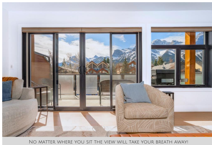
NO MATTER WHERE YOU SIT THE VIEW WILL TAKE YOUR BREATH AWAY!